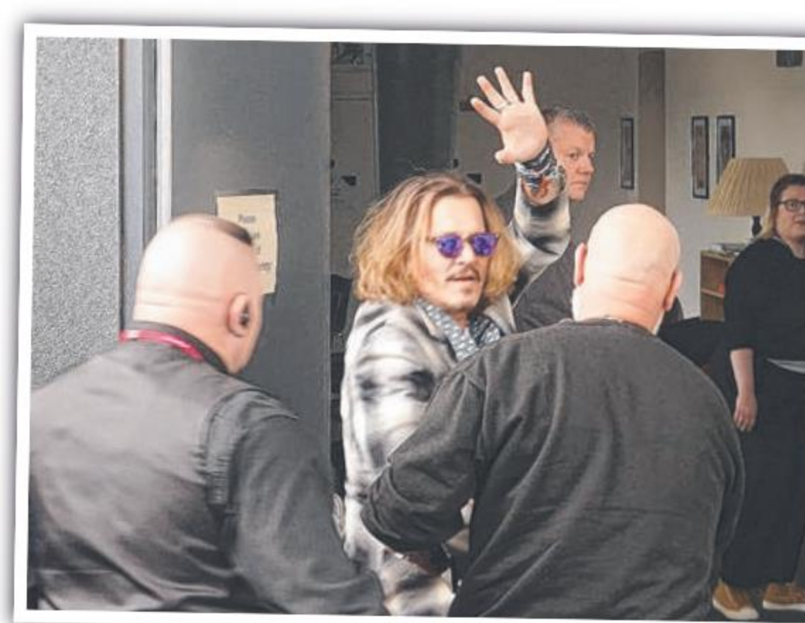
Johnny Depp at the Sage Gateshead.

Depp sang John Lennon's song Isolation, Marvin Gaye's What's Going On, The Everly Brothers' Let It Be Me, Little Wing by Jimi Hendrix and Killing Joke's The Death and Resurrection Show.